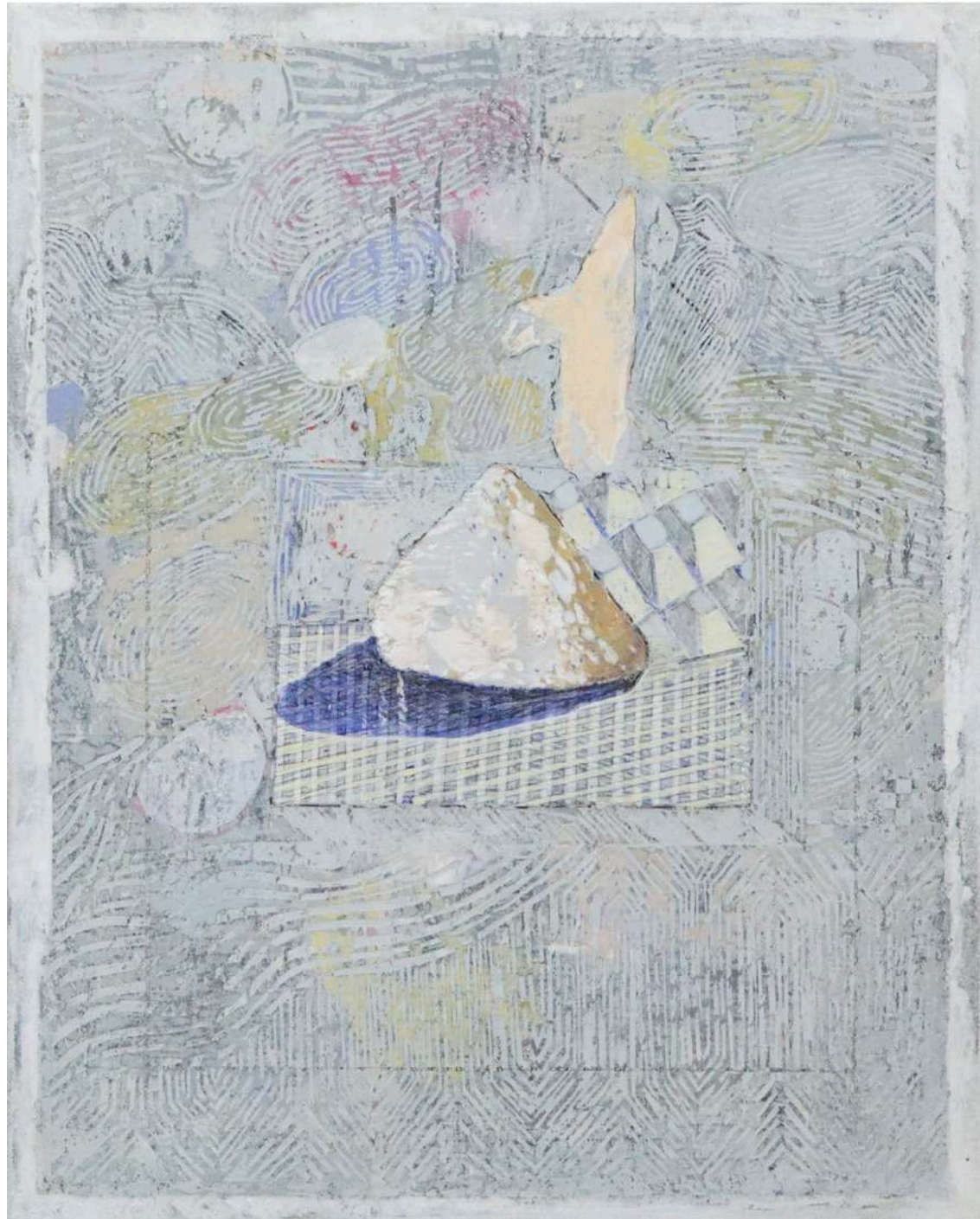
Untitled , 2025 Mixed Media, Canvas 38 x 30.5 cm (15 x 12 in)