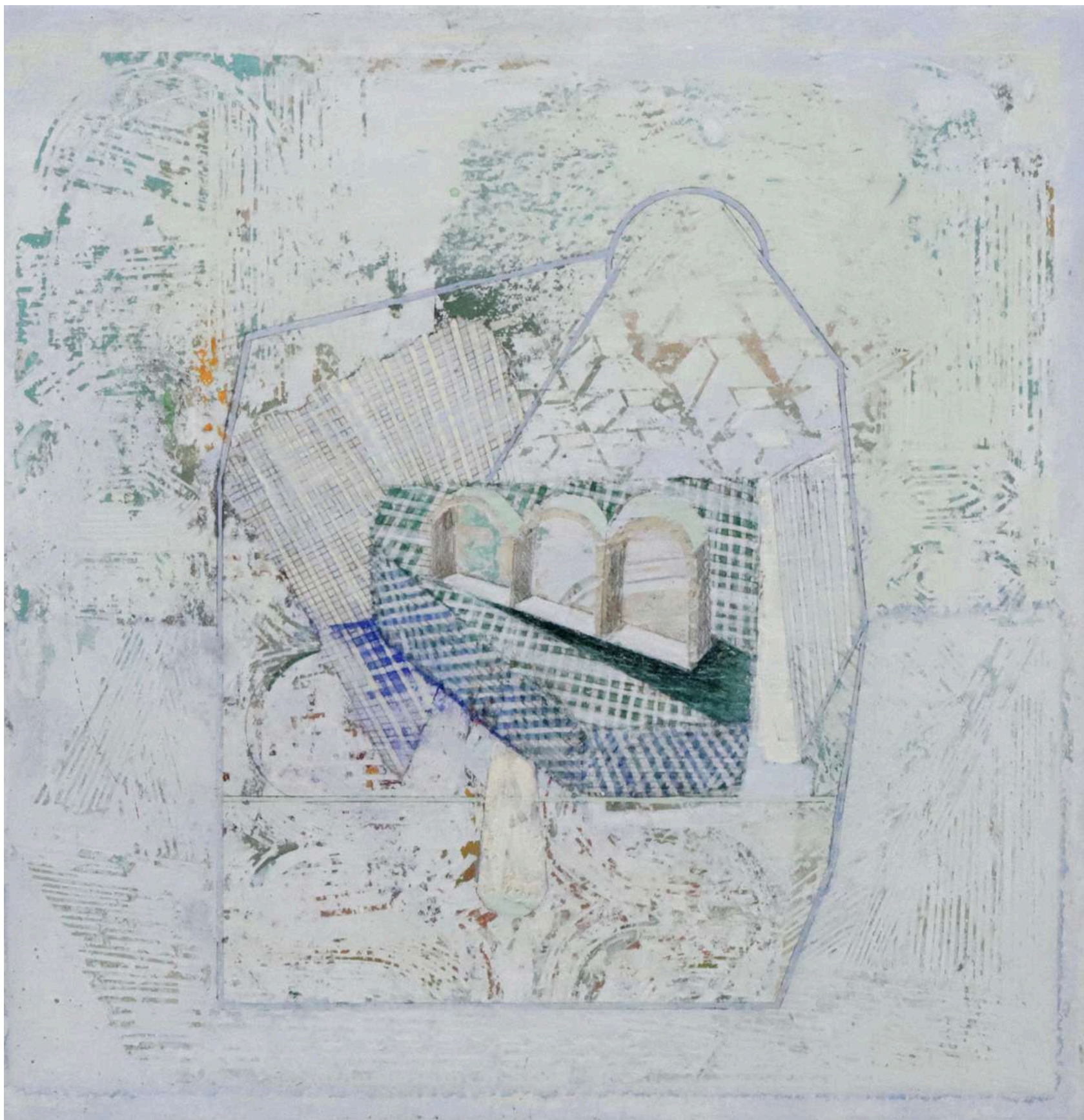
Untitled , 2025 Mixed Media, Canvas 30.5 x 30.5 cm (12 x 12 in)