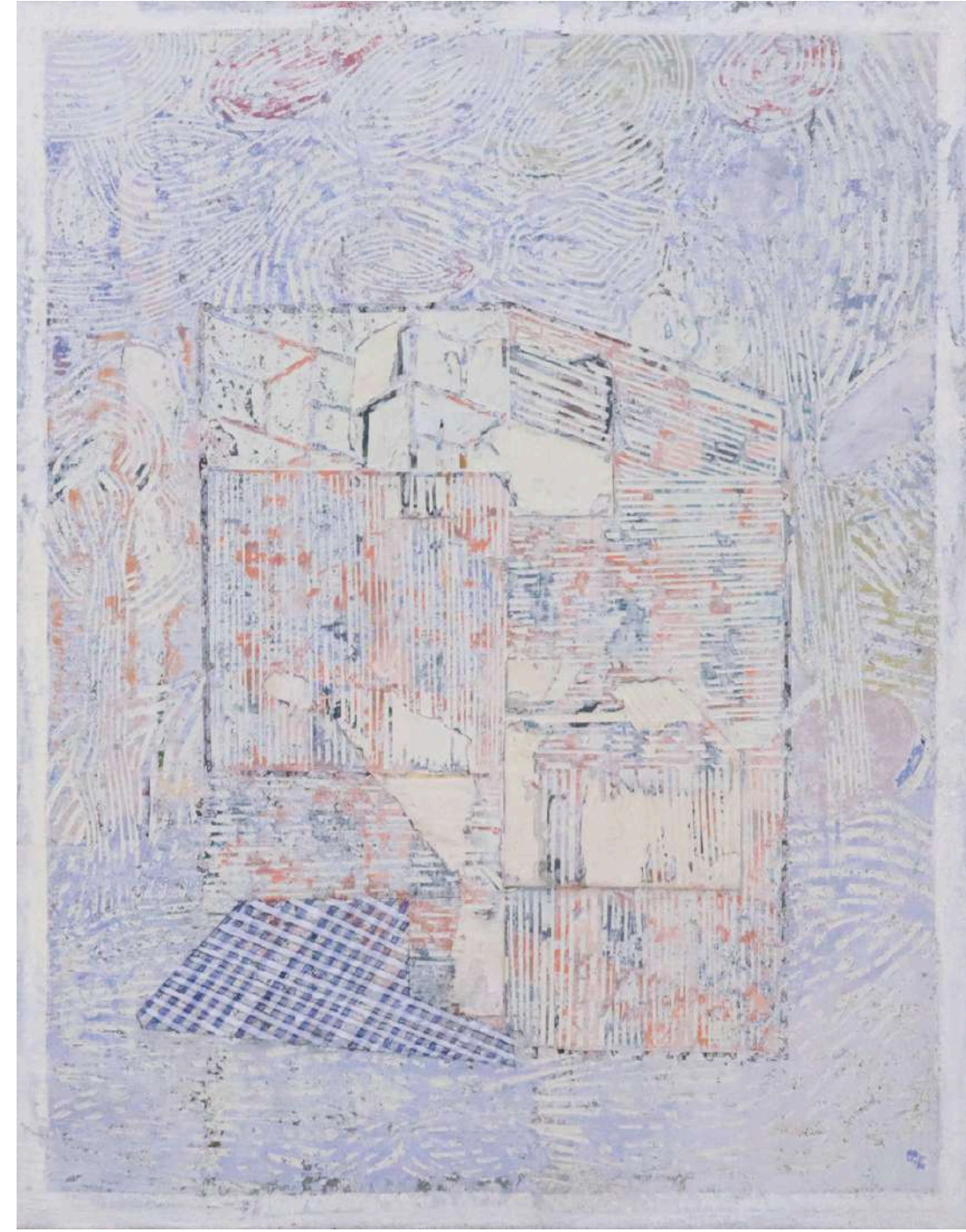
Untitled , 2025 Mixed Media, Canvas 38 x 30.5 cm (15 x 12 in)