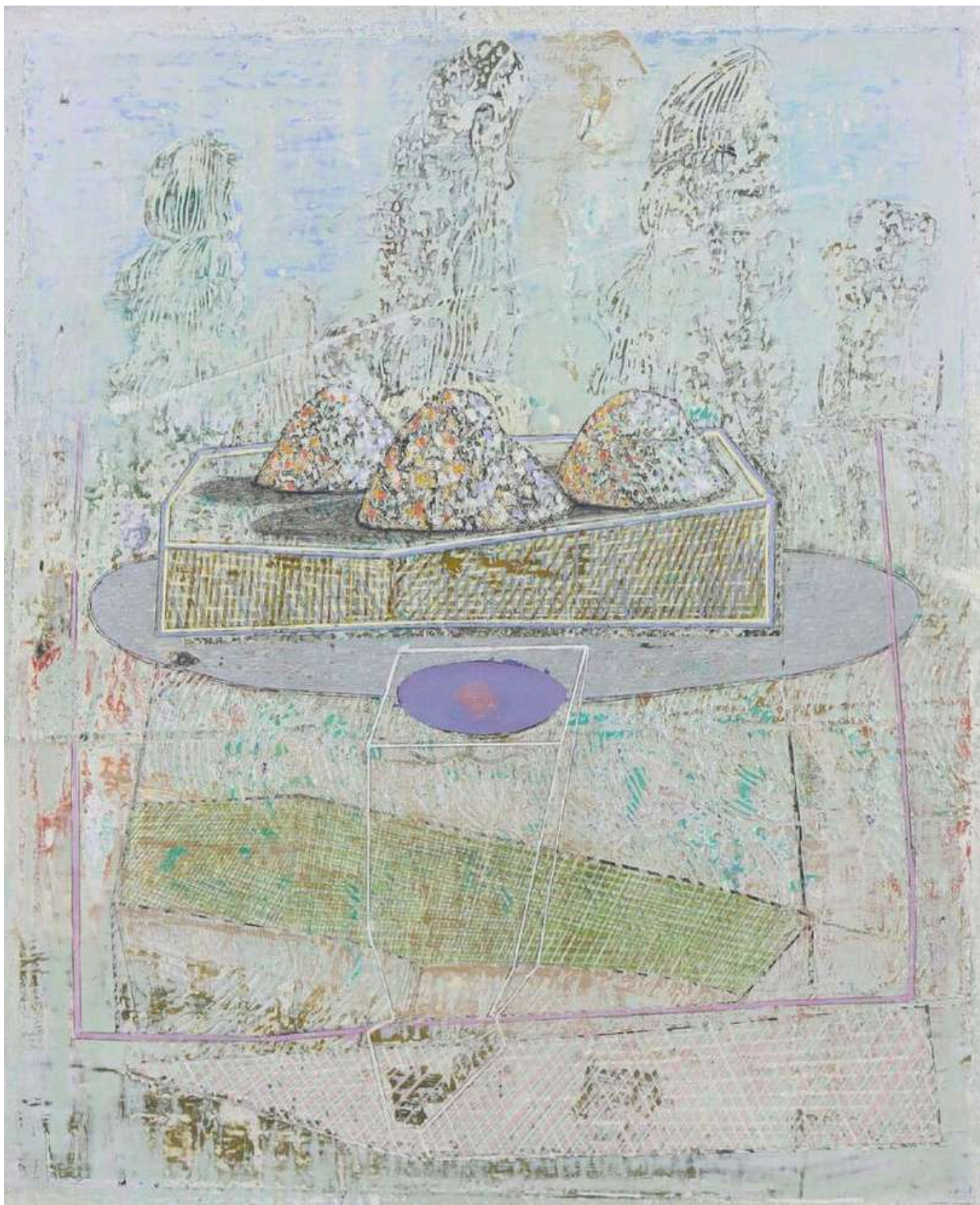
Untitled , 2026 Acrylic, Paper Collage, Canvas 45.5 x 37 cm (18 x 14.5 in)