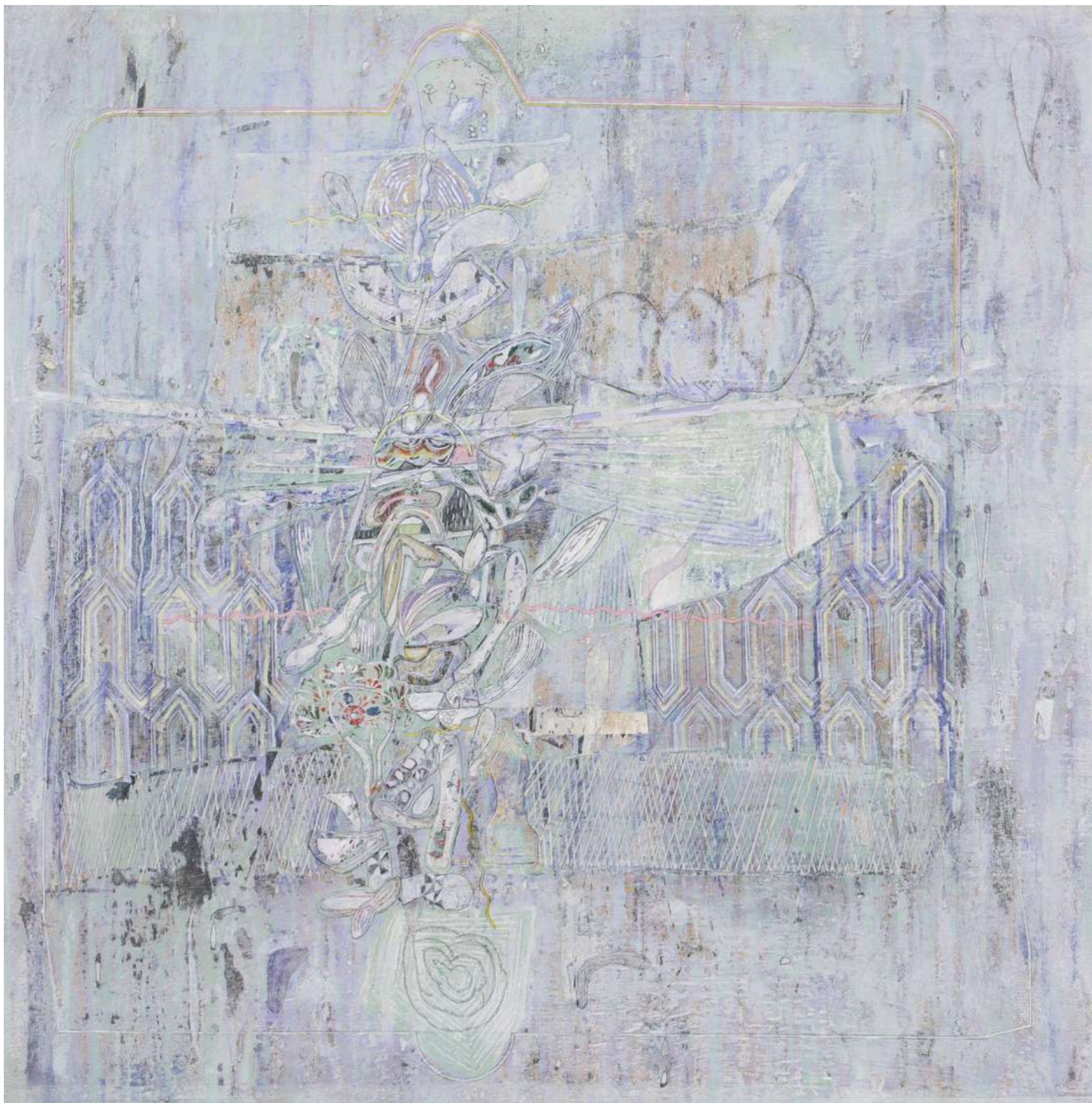
Untitled , 2025 Acrylic, Paper Collage, Canvas 76 x 76 cm (30 x 30 in)