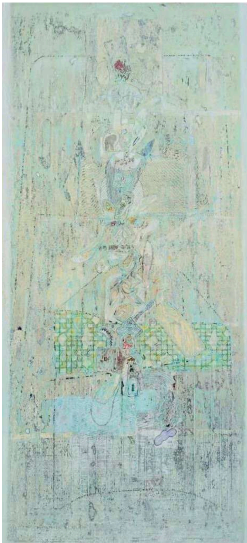
Untitled , 2025 Acrylic, Paper Collage, Canvas 137 x 66 cm (54 x 25 in)