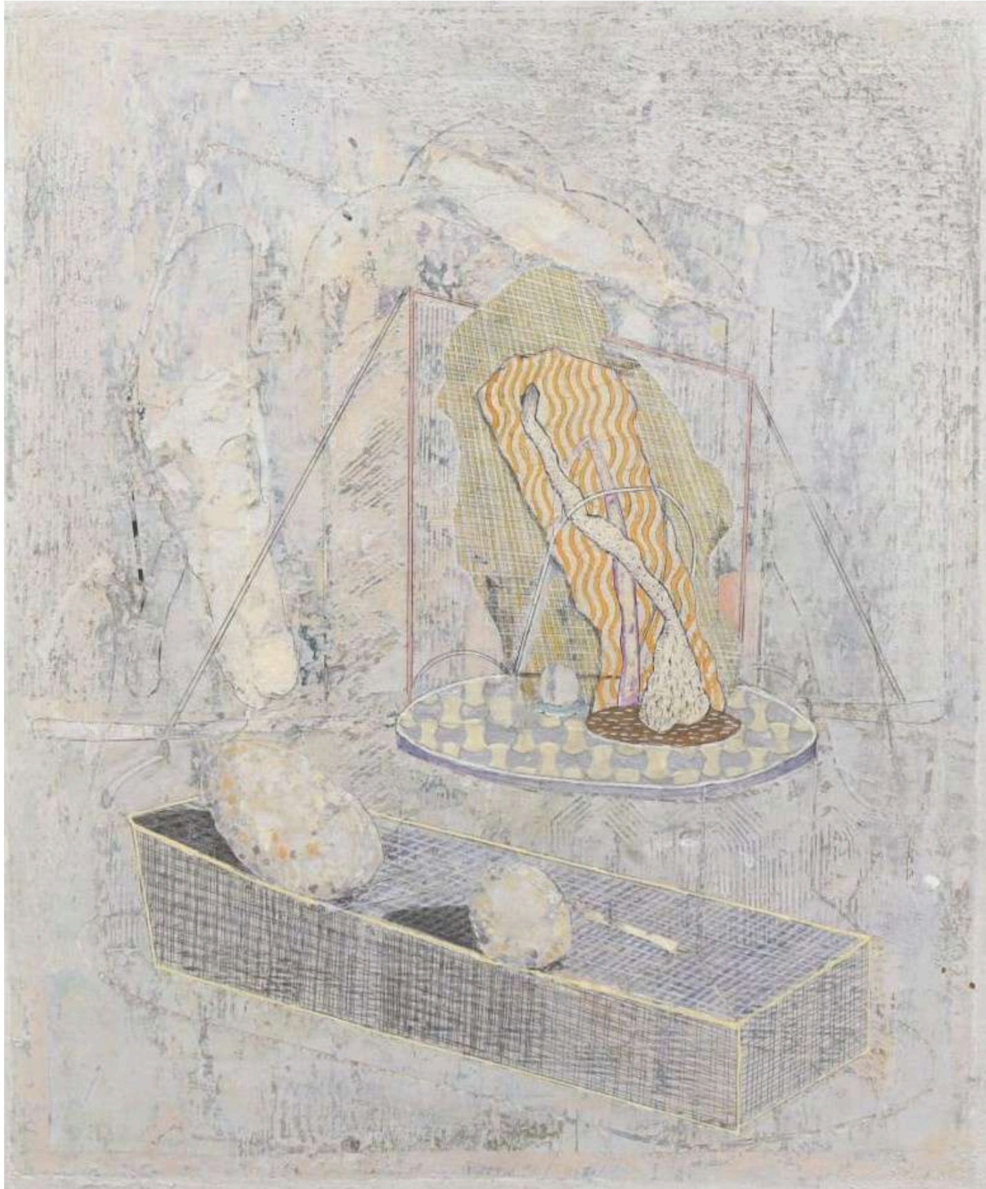
Untitled , 2026 Acrylic, Paper Collage, Canvas 45.5 x 38 cm (18 x 15 in)