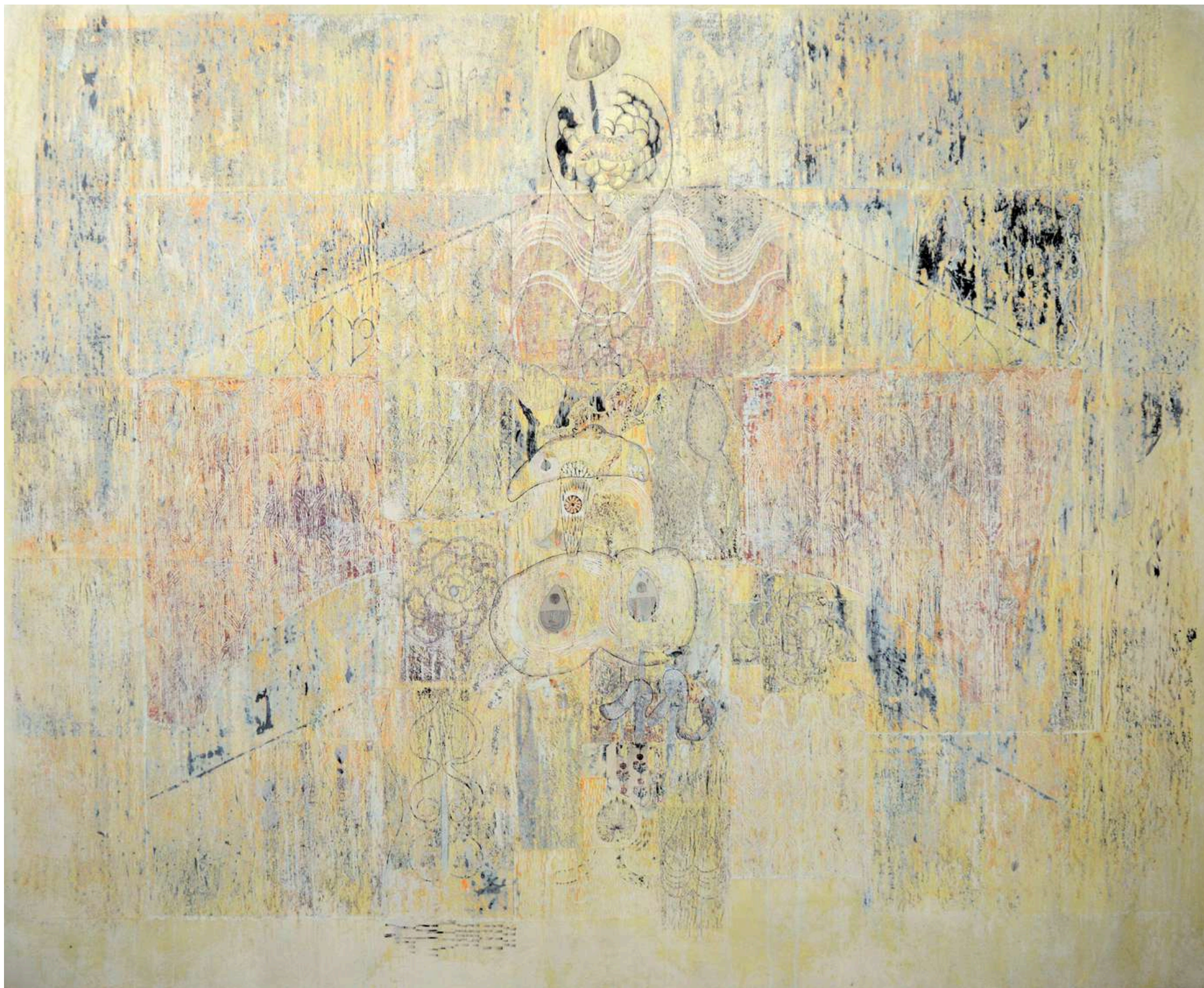
Untitled , 2024 Acrylic, Paper Collage, Canvas 152.5 x 183 cm (60 x 72 in)