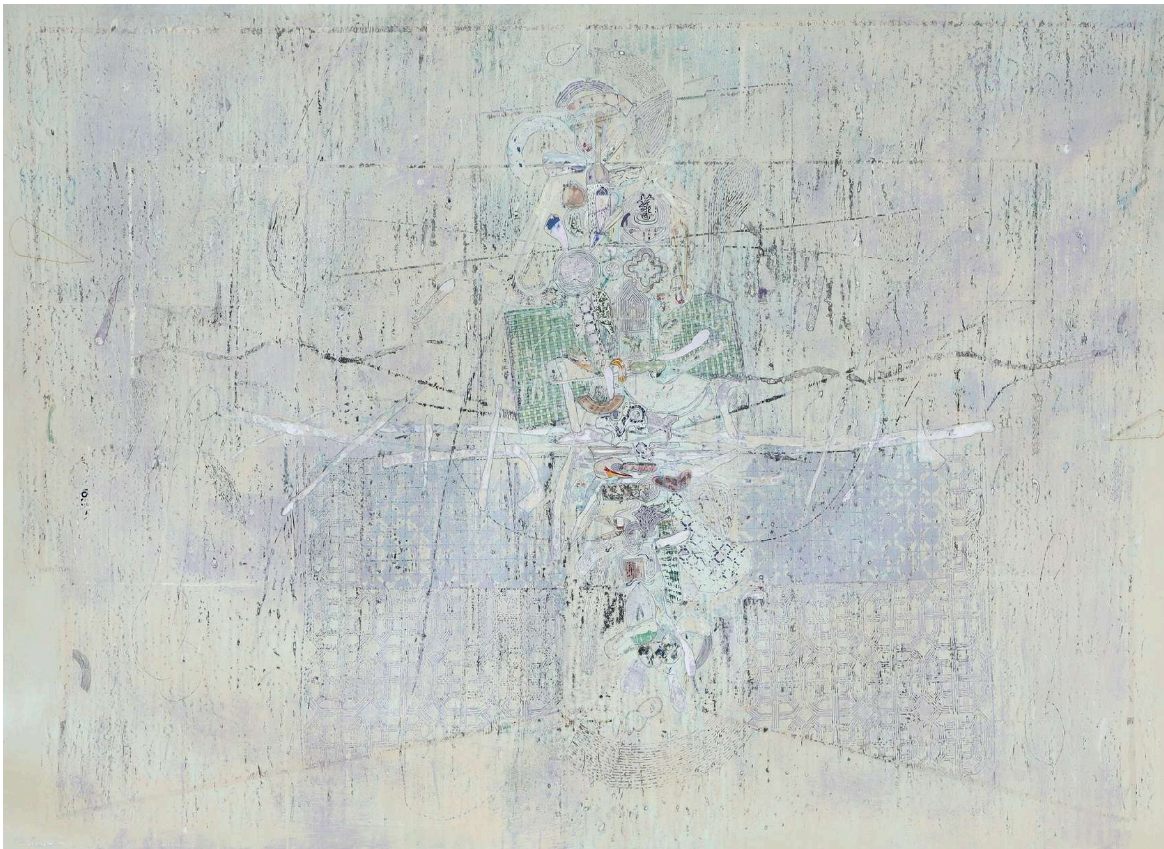
Untitled , 2025 Acrylic, Paper Collage, Canvas 165 x 228.5 cm (65 x 90 in)